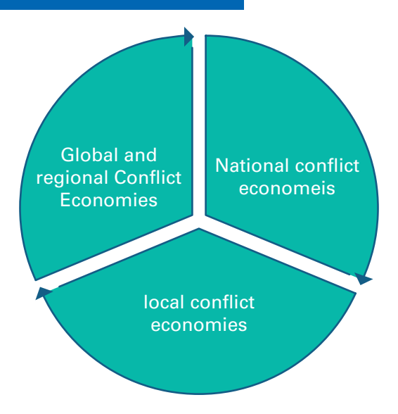
Figure 2: Interconnections of Different Levels of Conflict Economies

It was state actors that played key role in driving the conflict. Some of these were implementing continuations of policies preceding the conflict and some were adopting policies as part of an evolving strategy resulting from the dynamics of the conflict itself. The Syrian state was a central actor in driving the conflict and waging war on populations—armed and civilian alike-it saw as representing a threat to its rule. An initial period early in 2011 combined public declarations of an intent for change with some political and institutional reforms. However, with the onset of militarization, the violence heightened to unprecedented levels. The state's allies, Iran and Russia as well as Hizballah, enabled the government to wage the war, while themselves engaging in direct military actions. For these external actors, in some cases their causes overlapped with that of the Syrian government, and in other cases they had self-interested and geopolitical reasons for pursuing the conflict. Though ostensibly limiting themselves to the support of the central government, they developed their own policies that inevitably intervened in national and local policies. Iran and Hizballah's involvement exacerbated the geopolitical nature of the conflict.